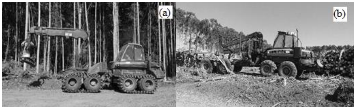
Figure 1. Machines evaluated in this study. (a) harvester; and (b) forwarder. Figura 1. Maquinas avaliadas neste estudo. (a) harvester; e (b) forwarder.

The experiment was carried out in a Eucalyptus saligna Smith stand implanted in 3 m x 2 m spacing under a clear cutting system. The statistical population was evaluated at 10 years old in areas with homogeneous soil, relief and site characteristics, presenting mean tree variables of: 43 cm of diameter at 1.3 m; 23 m of total height; and 0.42 m 3 whole stem individual volume. The cut-to-length wood harvesting system was evaluated and composed by a harvester for tree cutting and a forwarder to perform pulpwood extraction with 7.2 m length (Figure 1).